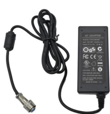
Adaptor * 1 pcs