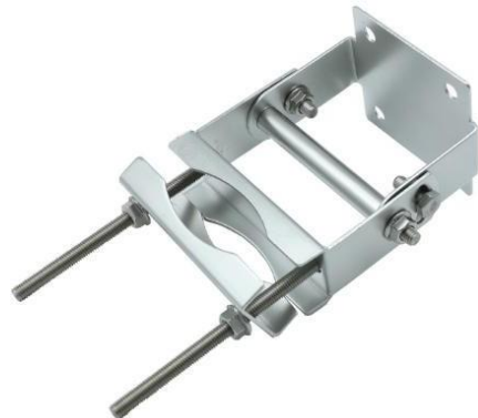
Bracket * 1 set