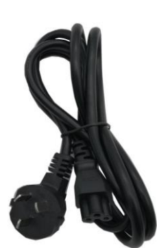
Power Cable * 1 pcs